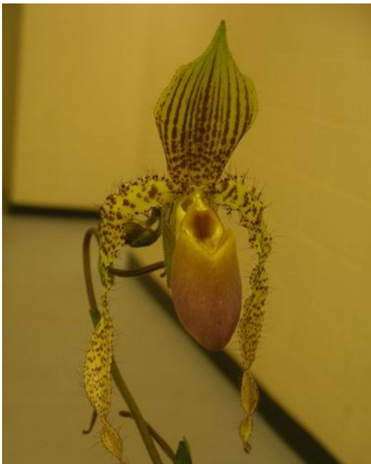
Paph. Lawless Walkure