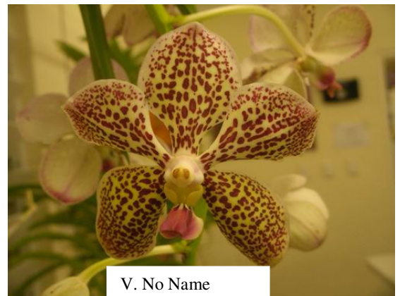
V. No Name