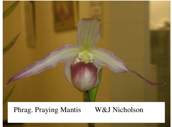
Phrag. Praying Mantis